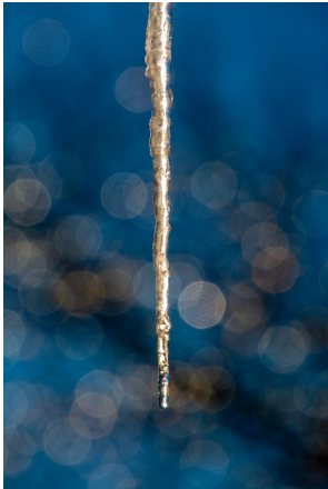
Piece of snow or ice