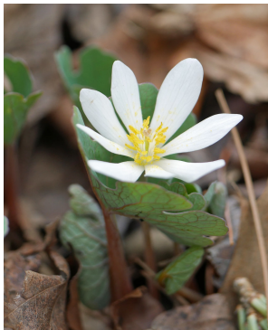
20. Bloodroot blooming: try scratching the stem to see where this flower's name comes from